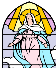
Assumption of Mary