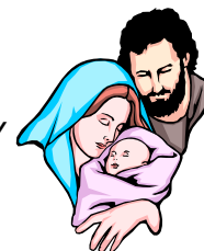
Feast of the Holy Family