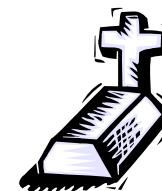
Feast of All Souls