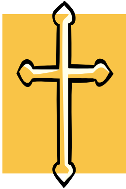
September Table Card

What good is it, my brothers, if someone says he has faith but does not have works? Can that faith save him? If a brother or sister has nothing to wear and has no food for the day, and one of you says to them, "Go in peace, keep warm, and eat well," but you do not give them the necessities of the body, what good is it? So also faith of itself, if it does not have works, is dead. (James 2:14-17)