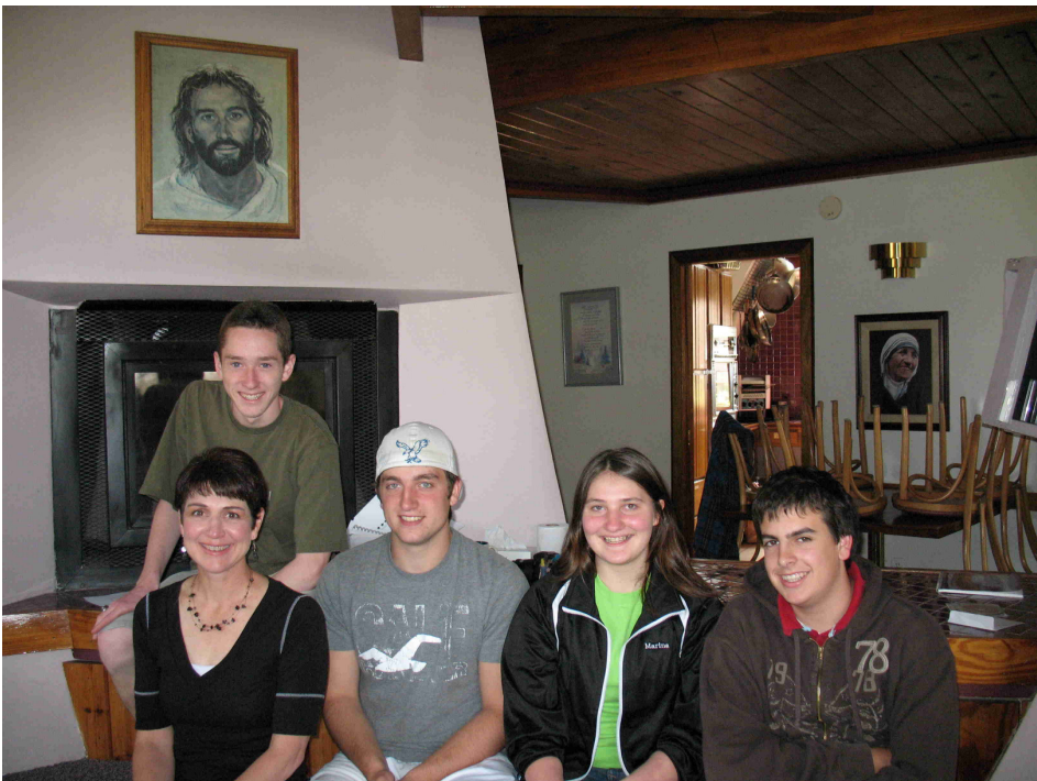
Retreat at St. Benedict's April 25-27, 2008