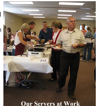
Our Servers at Work