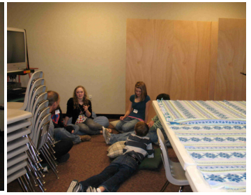
Tie blankets — Community outreach