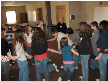
Tied up in knots— community building