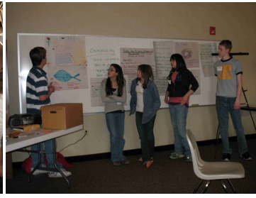
What their community would look like — Group presentation