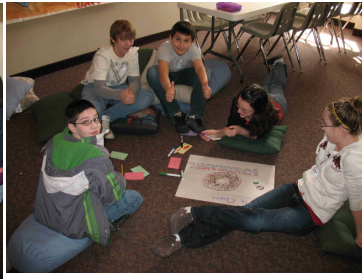
What their ideal church would look like — Group discussion