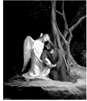
By Carl Heinrich Bloch, c. 1870

Closing Prayer: Steadfast and loving Father, so much in life carries with it burdens, extra responsibilities, even at times suffering and pain. Help us be strong in facing such things in our life. Help us to surrender them to you. Amen.