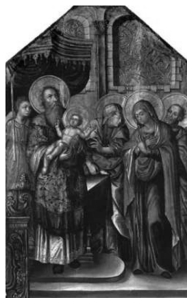
Orthodox icon, c. 1731

Closing Prayer: We give you thanks, O God, for each blessing in our life, especially the blessing of those we love. Help us to never limit their growth in faith and love. Make them a light so that others may see your goodness in them. Amen.