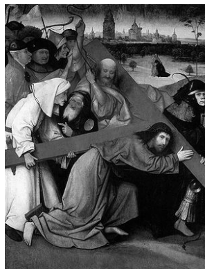
By Hieronymus Bosch, c. 1515

Closing Prayer: Lord of life and love, help us to discern which crosses we need to carry which ones we take on that are not necessary. Give us the strength to shoulder those true crosses with faith and hope. Amen.