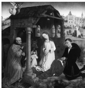
By Rogier Van der Weyden

Quiet Meditation: Life is God's gift to us. Who or what are the gifts which God is inviting us to contemplate in our hearts today?