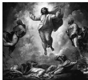
By Raphael, c. 1520

Jesus took Peter, John, and James and went up the mountain to pray. While he was praying his face changed in appearance and his clothing became dazzling white. And behold, two men were conversing with him, Moses and Elijah, who appeared in glory and spoke of his exodus that he was going to accomplish in Jerusalem.