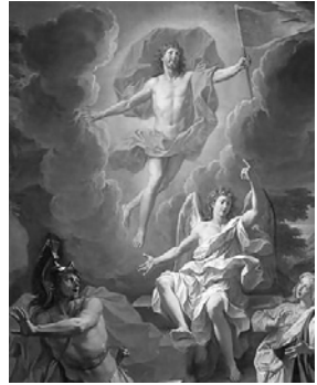
By Noel Coypel, 1700

tomb bringing the spices they had prepared. They found the stone rolled back from the tomb; but when they entered the tomb, they did not find the body of the Lord Jesus... "Why do you search for the Living One among the dead? He is not here; he has been raised up." (Luke 24:1-6; cf. Matt.28:1-8; Mark 16:1-8; John 20:1-18)