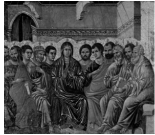
By Duccio di Buoninsegna

When the day of Pentecost came it found them gathered in one place. Suddenly from up in the sky there came a noise like a strong, driving wind which was heard all through the house where they were seated. Tongues as of fire appeared, which parted and came to rest on each of them. All were filled with the Holy Spirit. (Acts 2: 1-4; cf. John 20:22-23)