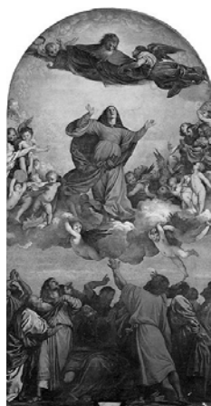
By Titian 1516-1518

Closing Prayer: God of creation, you desire that all creation share one day in the glorious freedom of the sons and daughters of God. In Jesus we taste the first fruits of that desire. In Mary's assumption we taste even closer our own hope that we might share in the fullness of resurrection, even as death claims our mortal bodies. Amen.