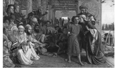
By William H. Hunt, 1860

When his parents saw him they were astonished, and his mother said to him: “Son, why have you done this to us? You see that your father and I have been searching for you in sorrow.” Jesus said to them: “Why did you search for me? Did you not know I had to be in my Father’s house?” (Luke 2:48-49)