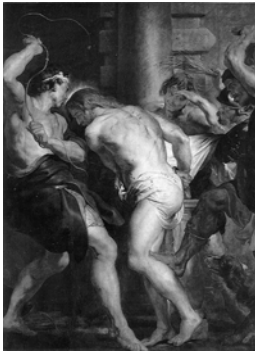
By Peter Paul Rubens

Pilate first had Jesus scourged, then he handed him over to be crucified. (Matt. 27:26; cf. Mark 15:15; John 19.1)