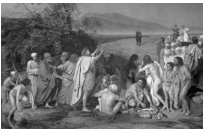
By Alexander Ivanov, c. 1850

Quiet Meditation: What things draw us away from being the sons and daughters God wants? Who or what is God asking us to pay more attention to? Can we surrender our hearts to the Lord?