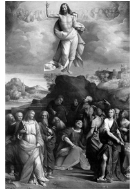
By Garofalo, c. 1515

Quiet Meditation: How are we today called to be the blessing of the risen Lord to others? Where is God asking us to be the presence of the risen Jesus? Where do we need to let go of overly narrow understandings of God and let God work “outside the box” in our lives?