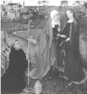
By Jacques Daret, c.1434

Closing Prayer: God of surprises, gracious Father, help us to rest secure in your love so that no matter what this day brings, we may peacefully and joyfully reflect your goodness to others. Amen.