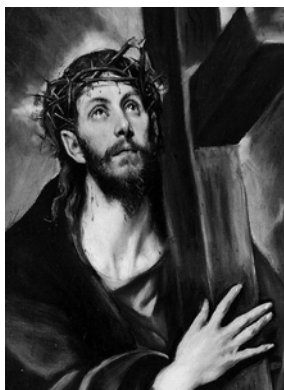
By El Greco, 1580

and put it on him, and began to salute him. “All hail! King of the Jews!” (Mark 15:16-17; cf. Matt.27:27-31; John 19:2)