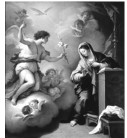
By Paolo de Matteis, 1712

Upon arriving, the angel said to Mary: “Rejoice, O highly favored daughter! The Lord is with you. Blessed are you among women.” Mary was deeply troubled by the angel’s words, and wondered what the greeting meant...”Do not fear, Mary. You have found favor with God. You shall conceive and bear a son and give him the name Jesus.” (Luke 1:28-31.)