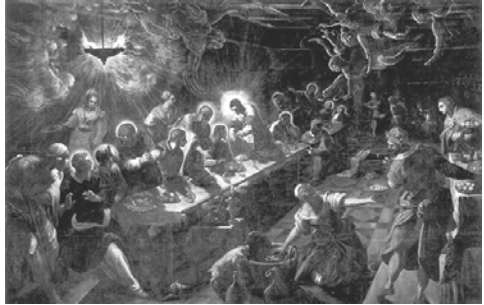
By Tintoretto, 1594

Quiet Meditation: When I come to Eucharist, what am I offering to God through Jesus? When I receive communion, how is God asking me to live it out for the sake of others? When I look upon the Eucharist, do I see Jesus' gift of his life to me and his invitation to be that gift to others?