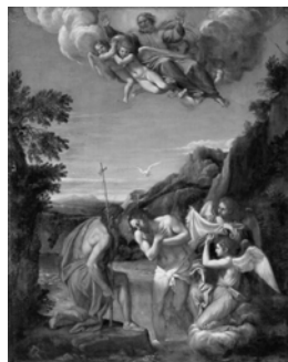
By Francesco Albani, 1600s

On coming up out of the water he saw the heavens being torn open and the Spirit, like a dove, descending upon him. And a voice came from the heavens, 'You are my beloved Son; with you I am well pleased.' (Mark 1: 9-11. cf. Matthew 3: 13-17, Luke 3: 21-23, and John 1: 32-33)